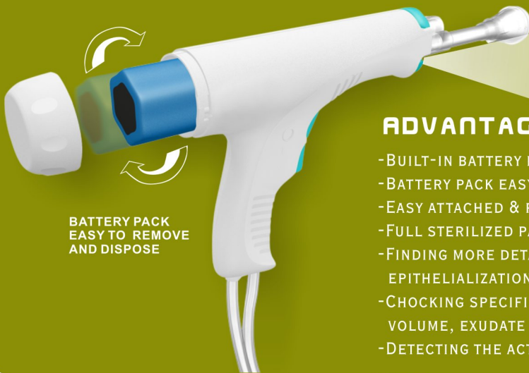
BATTERY PACK EASY TO REMOVE AND DISPOSE